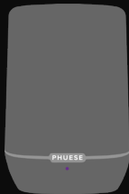
PHUESE One device